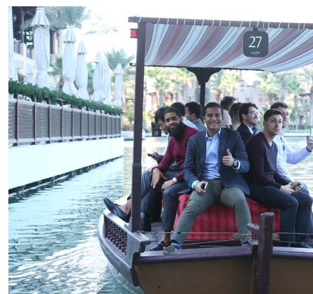
Trek Recaps - pg 16