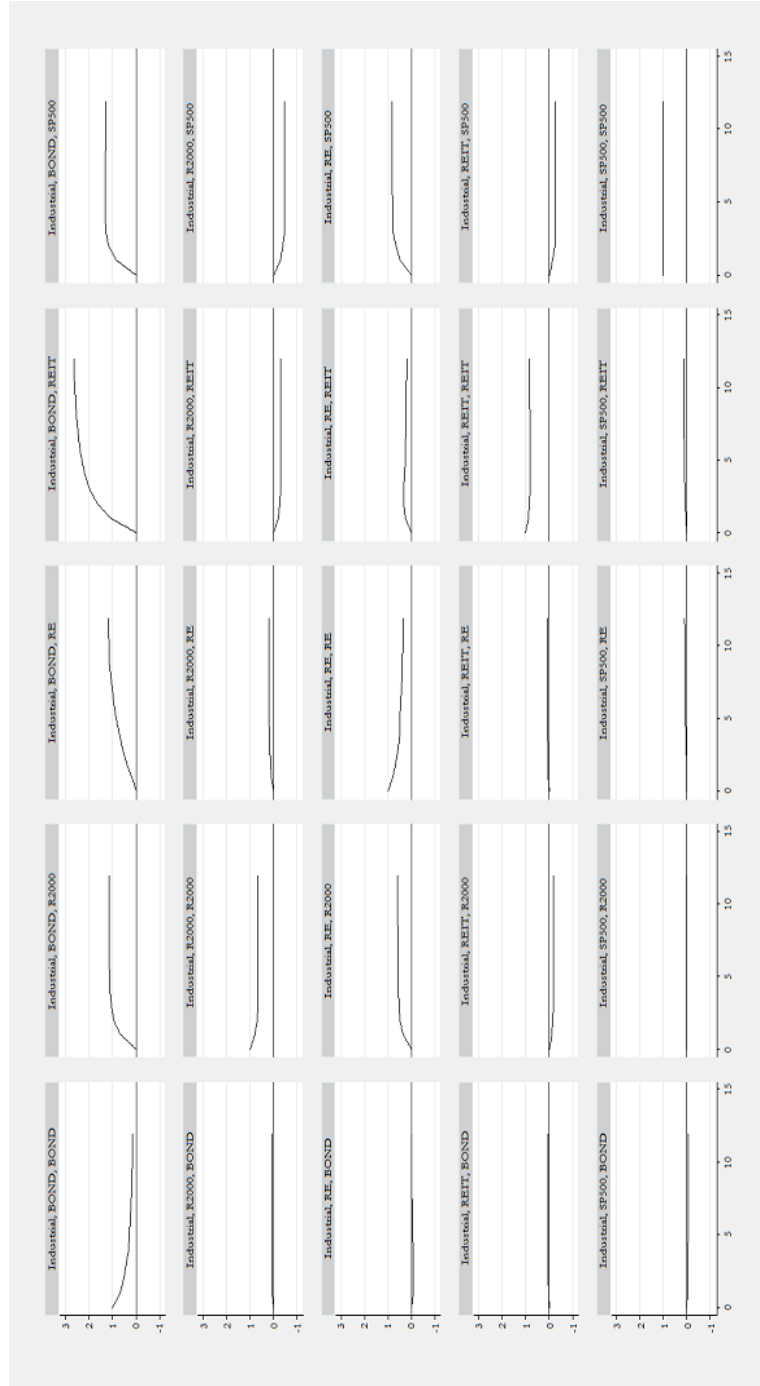
Figure reports impulse response functions for the VECM (2) VECM includes REIT the NAREIT FTSE Equity REIT industrial Index, RE the aggregate MIT/TBI industrial property type indexes, the S&P500 index, the Russell 2000 value index and the Barclay's BAA long term corporate bond index. Data are quarterly and cover the period Q2 1994 to Q4 2009. Impulse response functions are reported for every possible impulse and response combination in the VECM and are labeled as "Industrial, Impulse variable, Response variable."