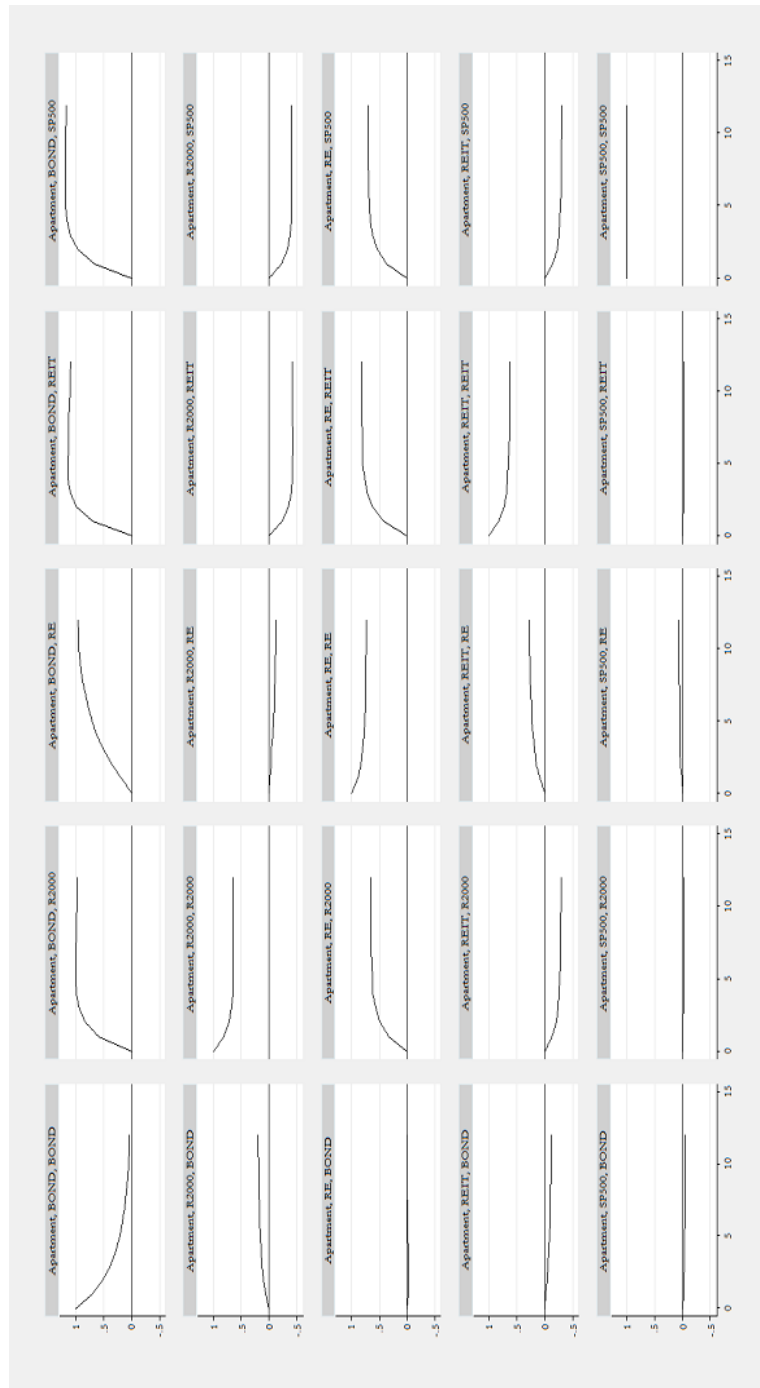
Figure reports impulse response functions for the VECM (2) VECM includes REIT the NAREIT FTSE Equity REIT apartment Index, RE the MIT/TBI apartment property type indexes, the S&P500 index, the Russell 2000 value index and the Barclay's BAA long term corporate bond index. Data are quarterly and cover the period Q2 1994 to Q4 2009. Impulse response functions are reported for every possible impulse and response combination in the VECM and are labeled as "Apartment, Impulse variable, Response variable."