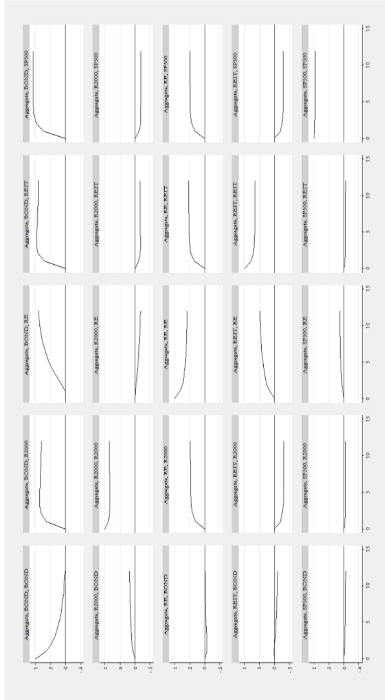
Figure reports impulse response functions for the VECM (2) VECM includes REIT the NAREIT FTSE Equity REIT Index, RE the aggregate MIT/TBI index, the S&P500 index, the Russell 2000 value index and the Barclay's BAA long term corporate bond index. Data are quarterly and cover the period Q2 1994 to Q4 2009. Impulse response functions are reported for every possible impulse and response combination in the VECM and are labeled as "Aggregate, Impulse variable, Response variable."