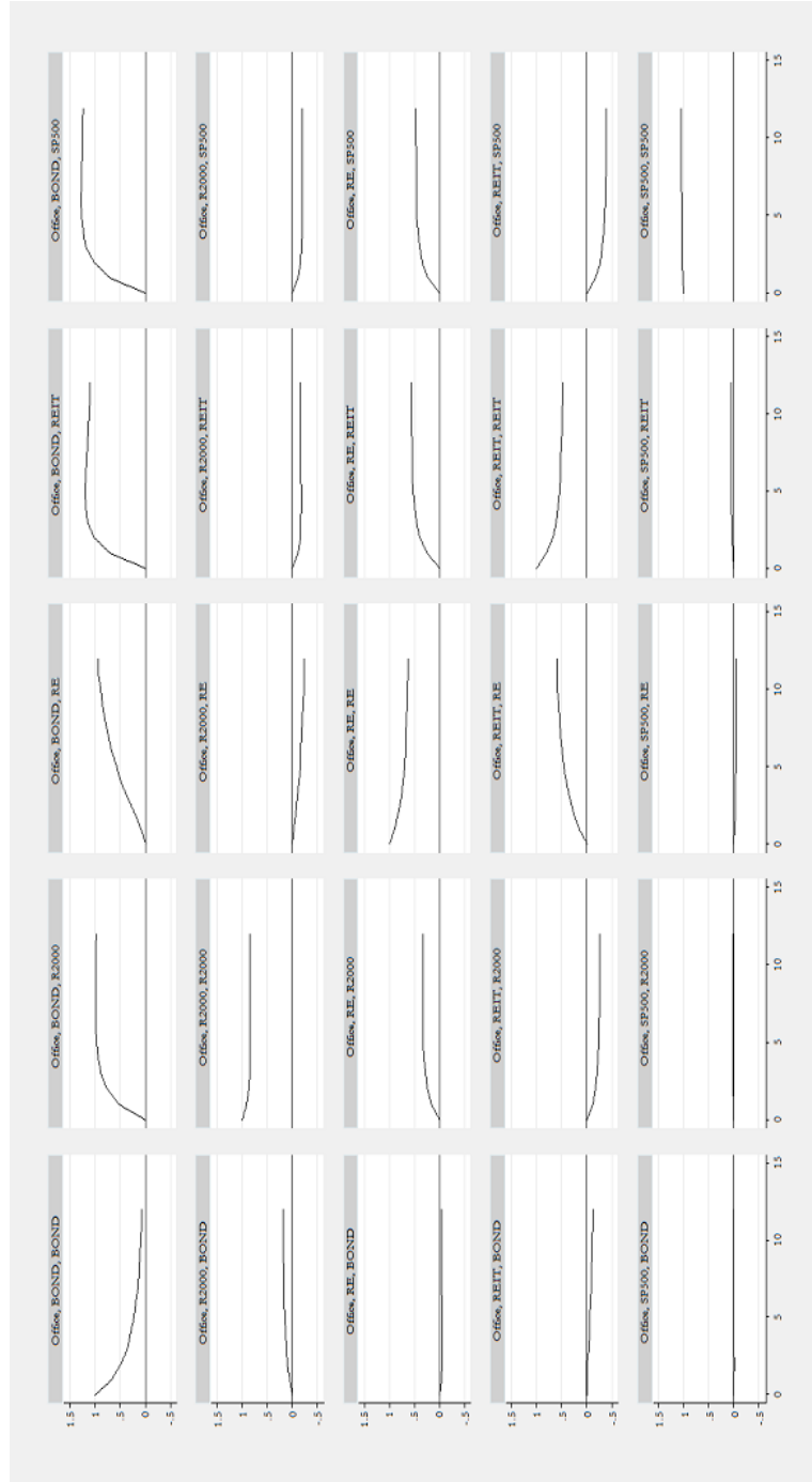
Figure reports impulse response functions for the VECM (2) VECM includes REIT the NAREIT FTSE Equity REIT office property Index, RE the MIT/TBI office property type indexes, the S&P500 index, the Russell 2000 value index and the Barclay's BAA long term corporate bond index. Data are quarterly and cover the period Q2 1994 to Q4 2009. Impulse response functions are reported for every possible impulse and response combination in the VECM and are labeled as "Office, Impulse variable, Response variable."